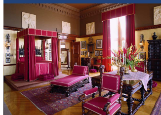
Grand Victorian architecture.