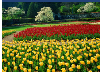
One of the Biltmore's many gardens.