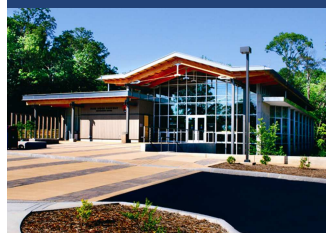
New Blue Ridge Parkway Visitor Center.