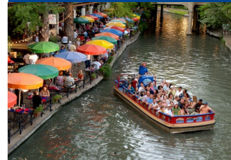
Relax on a cruise at the famous River Walk