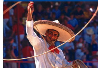
Enjoy the sights and sounds of San Antonio