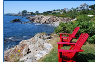
Explore quaint Kennebunkport