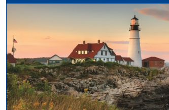
See the Portland Head Lighthouse

Departure: Multi-Purpose Center, 3000 W Jefferson St, Joliet, IL @ 8 am